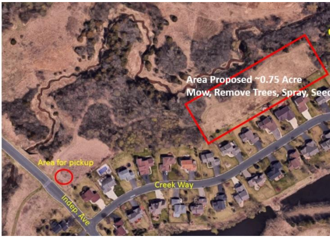
Project area in red. .75 acres. Park on Independence Ave. near Creek Way. Walk approximately 300 yards North along a walking path. There's a clearing on the right where the project is planned. Be advised there are many Wood Ticks in the area